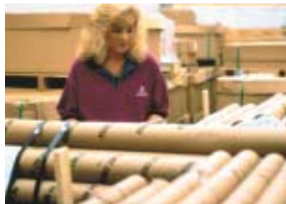
Crossville Distribution Center – USA

Our technicians are always ready to answer even your most complex questions. Using their practical knowledge and hands-on experience, they can support you in a variety of ways – from performing a field diagnosis to conducting new product training at your facility.