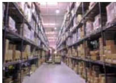
Mulheim Distribution Center – Germany